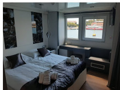
Upper Deck Cabin with Balcony VIP upper deck cabin