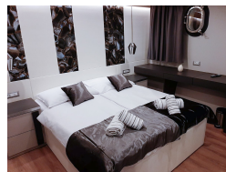
Below Deck Cabin