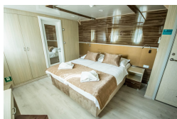
Upper Deck Balcony Cabin