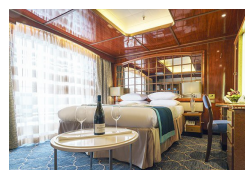
Main Deck Suite