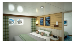
Category 1. From