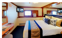
Orchid Cabins - Twin Share