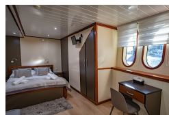
Upper deck cabin