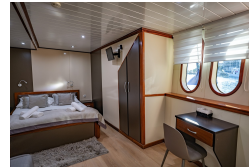
Upper deck cabin