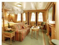
Category B. From