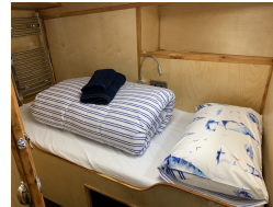
Single Cabin En-suite