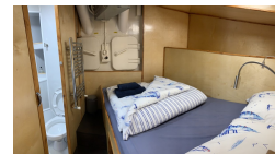
Twin / Double Cabin En-suite Twin Cabin