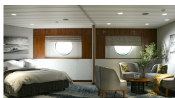
Expedition Suite. From