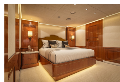
Category III - from