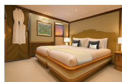
Owners Suite - from