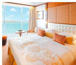
Balcony Stateroom S Deck 7