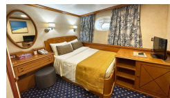
Category A USA