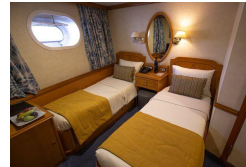
Category B USA