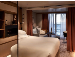
Balcony D6 - from