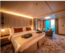
Oceanview D4 - from Premium Suite