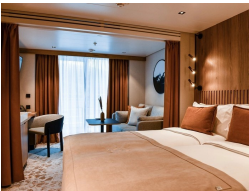
Junior Suite - from