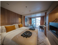
Balcony M5 - from