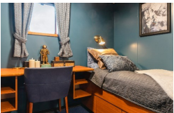
Signature Twin - Cabins 1-2 & 4-5