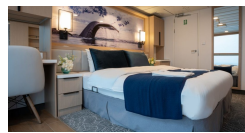
Grand Balcony Stateroom