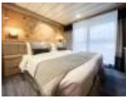
Deluxe Veranda Forward