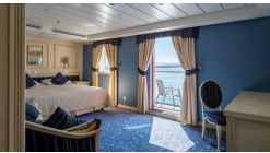
Executive Suites with Balcony - From.