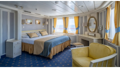
Standard Double/Twin Cabin - From.