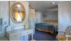
Owner's suites with private walkway - From.