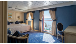
Junior Suite - From.