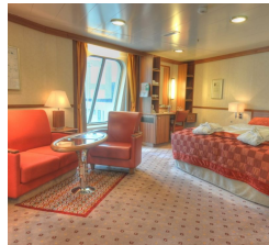
Expedition Suite. Waitlist