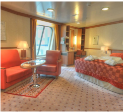
Polar Outside. From