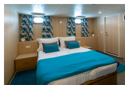
Lower Deck Cabin Single