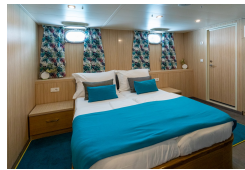
Lower Deck Cabin Single