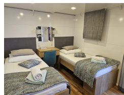
Main deck cabin