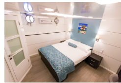
Lower deck cabin