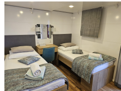
Main deck cabin