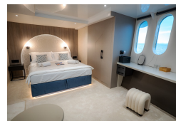
Upper Deck cabin