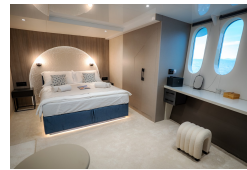
Below Deck Cabin