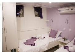
Lower Deck - SOLD OUT