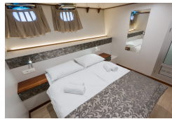
Below Deck Cabin