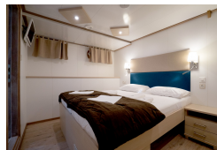
Main Deck - SOLD OUT