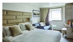
Cabin Category 4