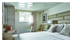
Cabin Category 2