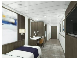
Aurora Stateroom Triple