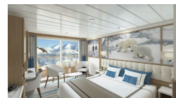
Balcony Stateroom Category B