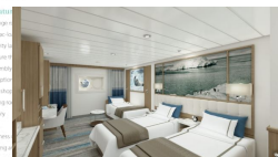
Balcony Stateroom B for single occupancy