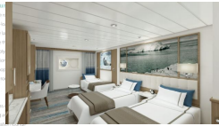
Balcony Stateroom B for single occupancy