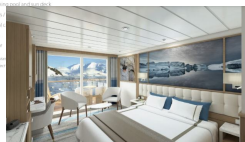
Balcony Stateroom Category A