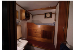
Single Cabin En-suite