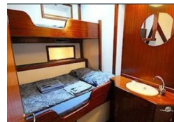
Category A Triple