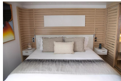
Deluxe Suite Deck 3