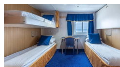
Cabin Category 2