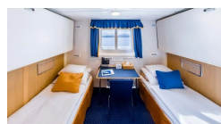
Cabin Category 5