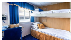
Cabin Category 3