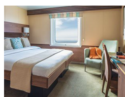
Category 5. From