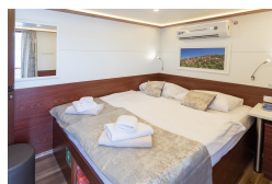
Lower Deck Cabin Single