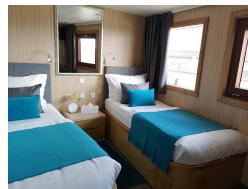
Upper Deck Cabin with Terrace