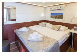
Lower Deck Cabin Single