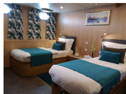
Lower Deck Cabin Single