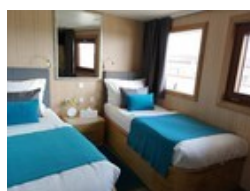
Upper Deck cabin with Terrace