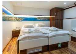
Lower Deck Cabin Single