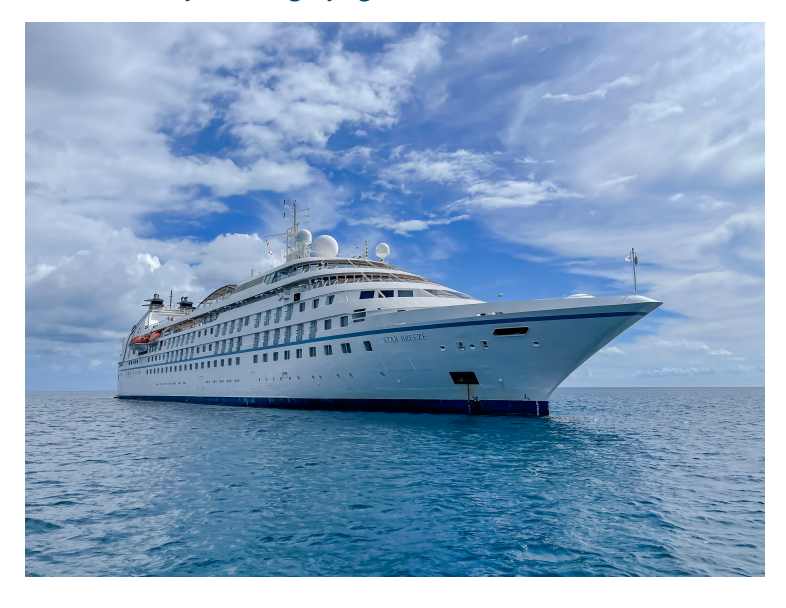
mirror and chair

Dial Phone L'Occitane Bath Amenities Fresh Fruit Hair Dryers and 110/220 outlets Wi-Fi Internet Access(various plans available for purchase) Mirrored closet with ample drawer space Granite vanity with magnifying