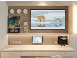
Category 5. From