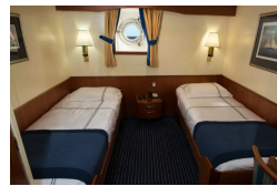
Main Deck Twin Porthole