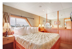
Jr Commodore Cabin