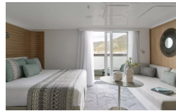
Deluxe Suite Deck 4