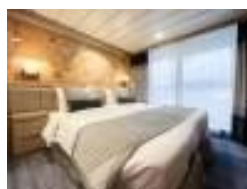
Studio Single Veranda Stateroom