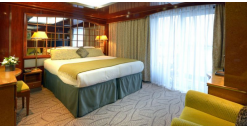
Magellan Deck Standard Single