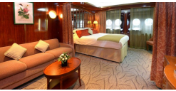
Magellan Deck Standard Suite