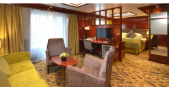
Explorer Deck Owner's Balcony Suite