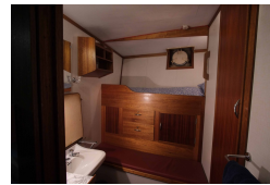
Twin Cabin Semi En-suite