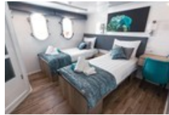
Main/upper deck cabin