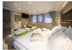
Above Deck Cabin