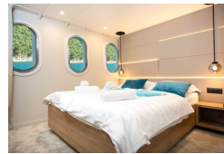
Above Deck VIP Cabins