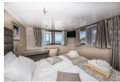
Below Deck Cabin