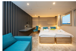
Main Deck VIP Cabin