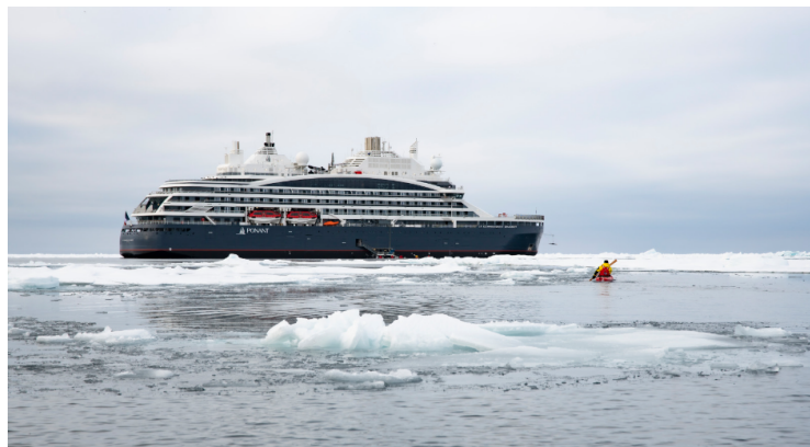
Zodiacs on board.

our Hospitality & Travel Manager officer, Our boutique which sells clothing, jewellery, beauty products, postcards and various accessories, The image & photo desk. The different lounges include a 302 m 2 main lounge including a 28 m 2 cigar lounge, a tea corner and a bar, with live music on selected evenings, A 400 m 2 panoramic bar and lounge, An open-air Bar. The recreation spaces Fitness & Beauty Corner: Fitness room: Elliptic, running machines, bicycles... Beauty Corner: Hairdresser, Massage rooms, Sauna, Snow Room, Nail Shop. Pool area: Indoor Pool and winter garden - Outdoor Pool Theatre: Capacity: 270-276 - Main show room for conferences and live entertainment on selected evenings - State-of-the-art audio and video technology. Leisure area: Public areas - Library - Medical centre. 16