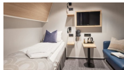
Junior Suite with Balcony. From