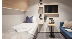
Junior Suite with Balcony. From