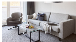
Seaview Superior Double