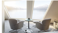
Seaview Deluxe. From