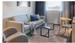
Seaview Superior King