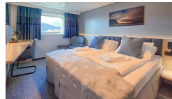
Seaview Superior from