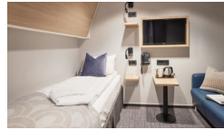
Panoramic Corner Mini Suite. From