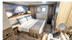
Balcony Stateroom - A