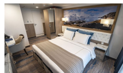
Balcony Stateroom - C