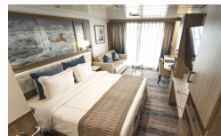
Balcony Stateroom - B