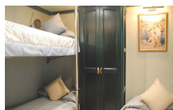
Tween Deck Economy. From